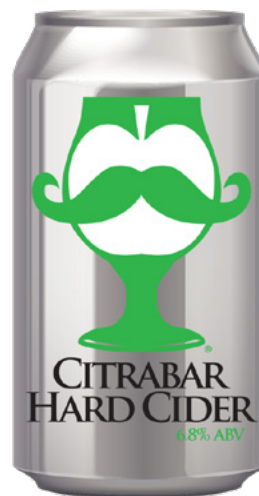
White behind green.

If you want to experiment with metallic colors, use different percentages of white behind your artwork for a design-popping effect. If you don't care about metallic colors, add 100% white under your artwork and you're set.