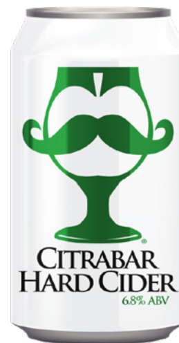
No white behind green.